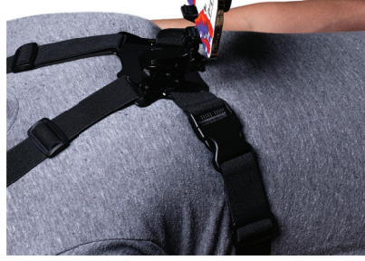
Chest Mount Phone Holder