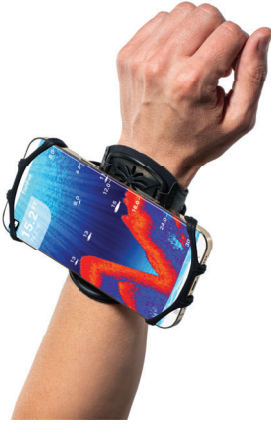
Wrist Mount Phone Holder